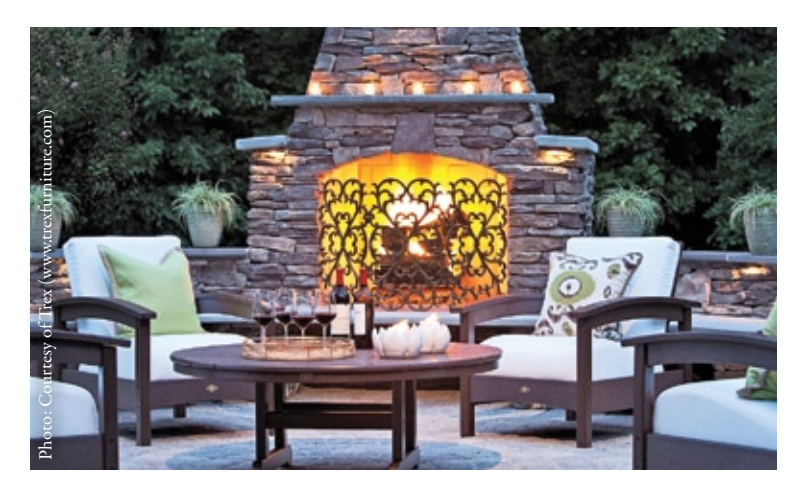
Trex has launched a line of outdoor furniture designed for extreme outdoor environments. The furniture is manufactured from high-density polyethylene with more than 90% recycled content. The marine-grade cushions are covered in all-weather Sunbrella fabrics.

wall of your home. If you bridge the style between the two spaces, the inside and outside can flow seamlessly one into the other. In this location it is simpler and less expensive to make the necessary plumbing, gas and electrical connections for your outdoor kitchen. You have less distance to walk back and forth to your main kitchen, if you forget a food or prep item. This arrangement offers some protection from the wind and rain, while also providing support for an awning, if desired. A large screened porch or 3-season room serves a similar function, while offering additional shelter from extreme weather and protection from insects. Keep in mind that a grill installed in a partially enclosed area requires a ventilation hood.