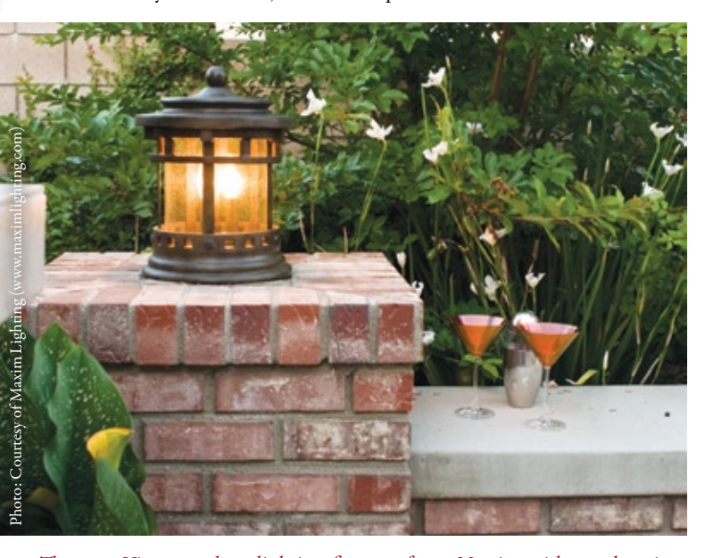
The new Vivex outdoor lighting fixtures from Maxim withstand moist climates and harsh weather conditions—perfect for water front homes. They are made from a hard, dense synthetic material that is twice as strong as polyurethane resin, non-corrosive and UV resistant.

There are advantages to having your outdoor living space close to your house, such as a patio that shares the exterior