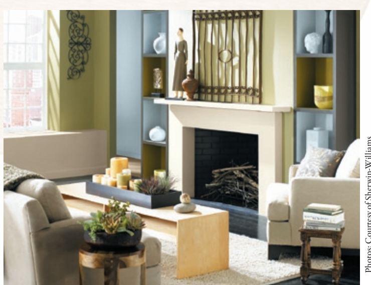
Local Momentum Color Palette

Under certain conditions heavy winds, dirt, sand and salt spray can affect the performance of retractable screens. Be sure to consult your contractor to see if they are appropriate for the use you may envision.